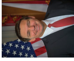
Florida Governor Ron DeSantis, Offi- cial Host of the 44th Annual SEUS/JAPAN Joint Meeting

For additional information please contact us at: